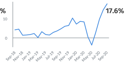
California Existing Single-Family Home Median Price Growth